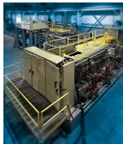
Hydraulic Power Unit for Schuler's Compact Crossbar Transfer Press

"There are no manual operations on the crossbar transfer press," described Kreth. "The crossbar